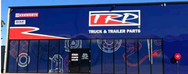
TRP Parkes, External