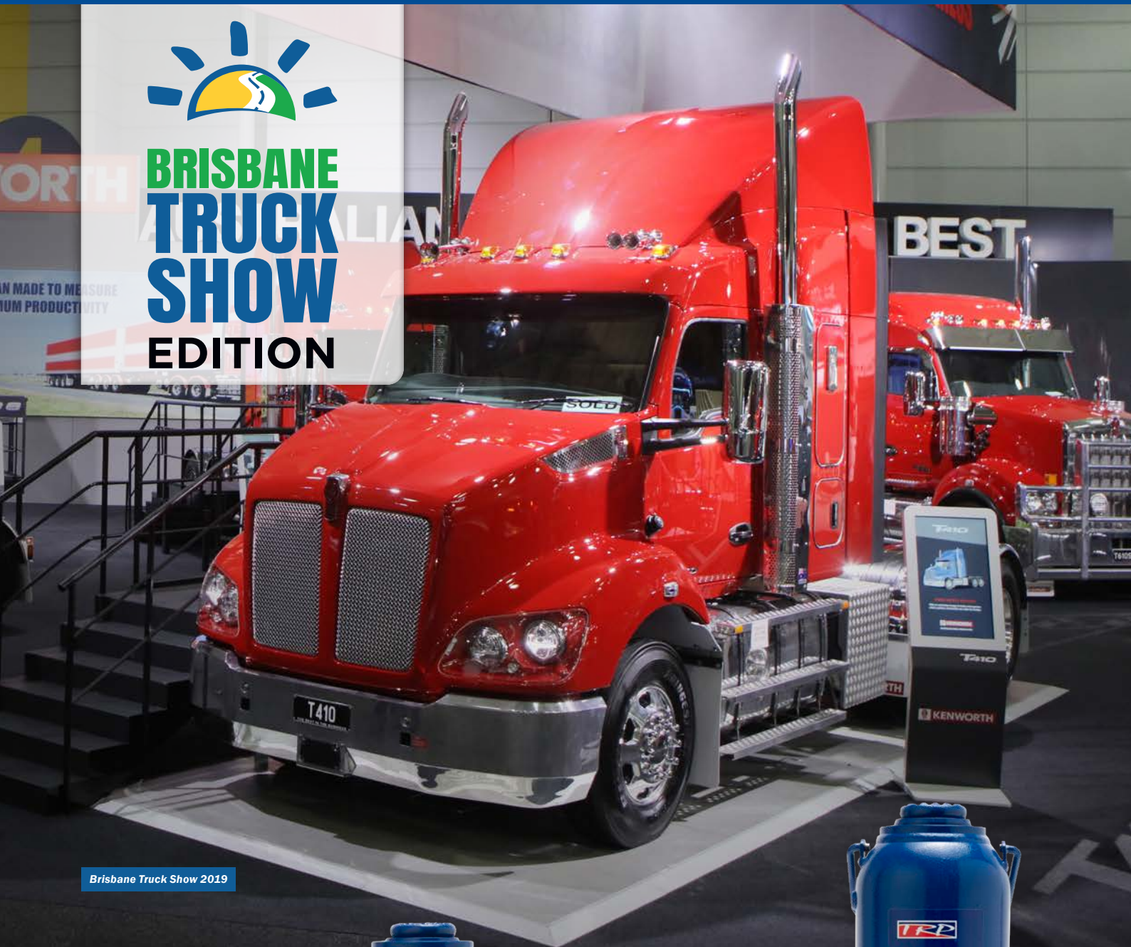
Brisbane Truck Show 2019