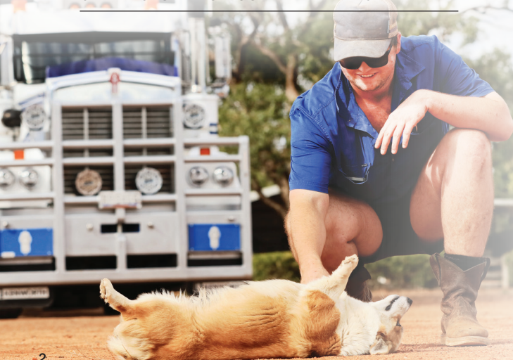
Fletcher with Lottie